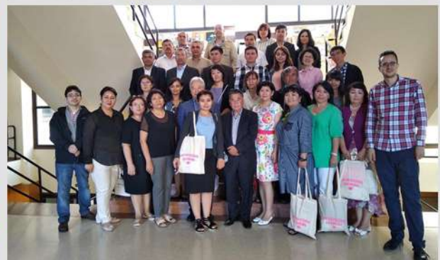
We regret to not having one last image of the partners together, but here is a selection of our group photos from past events